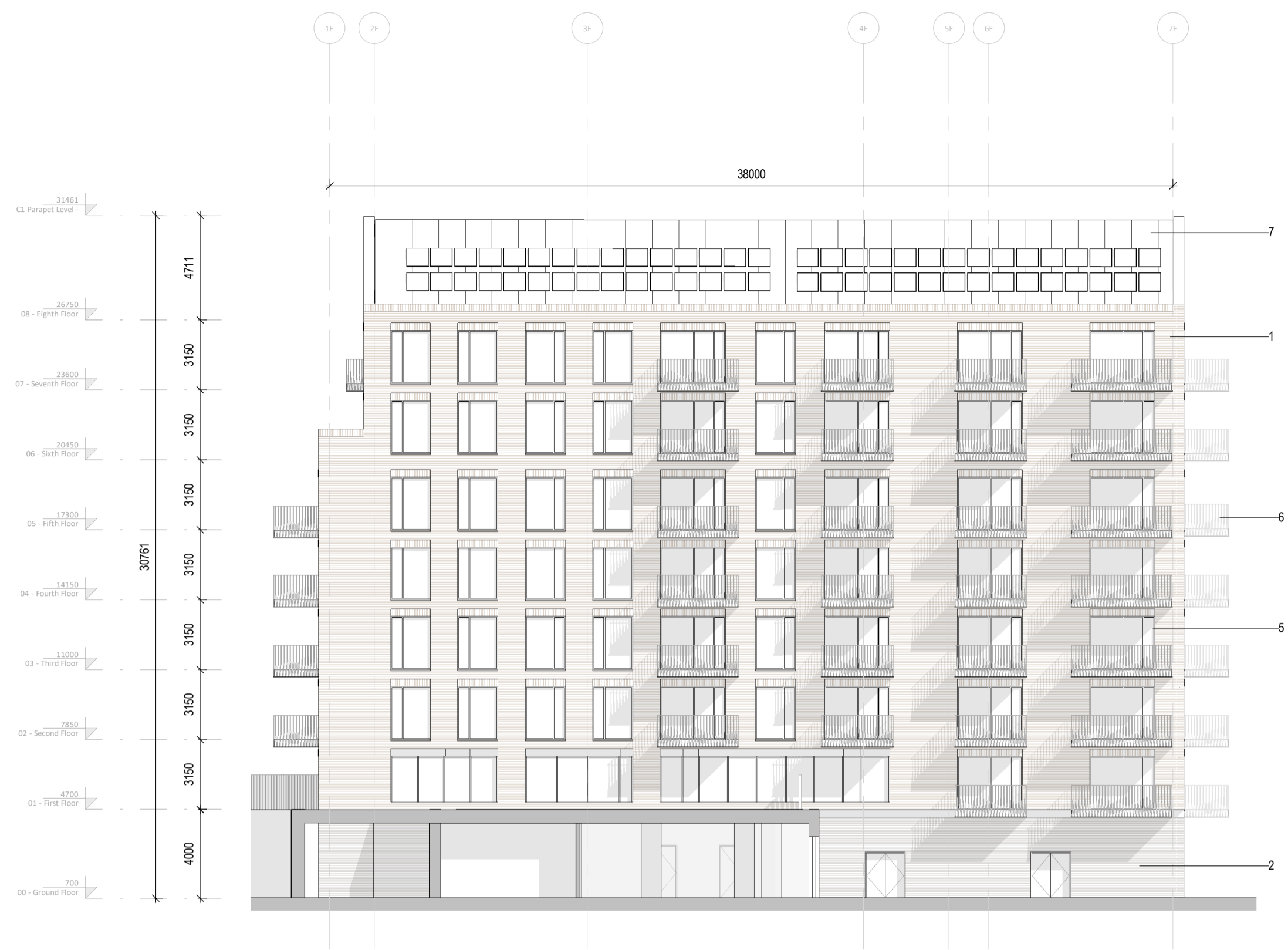
2 C1_South-East Elevation 1:200