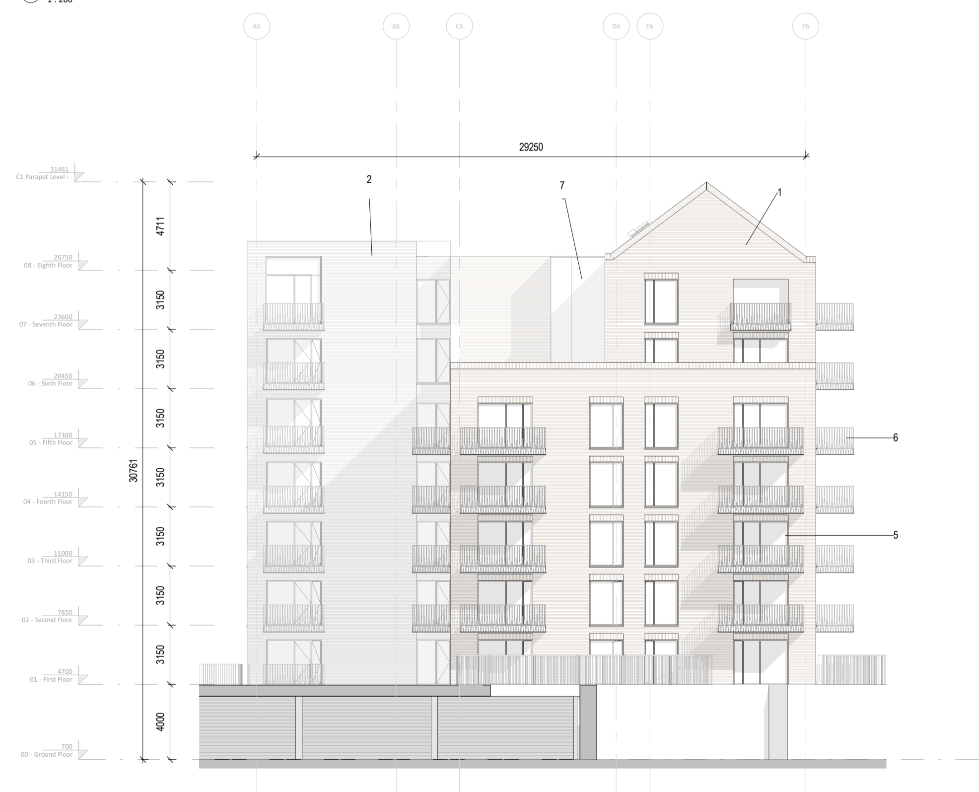
3 C1_South-West Elevation 1:200