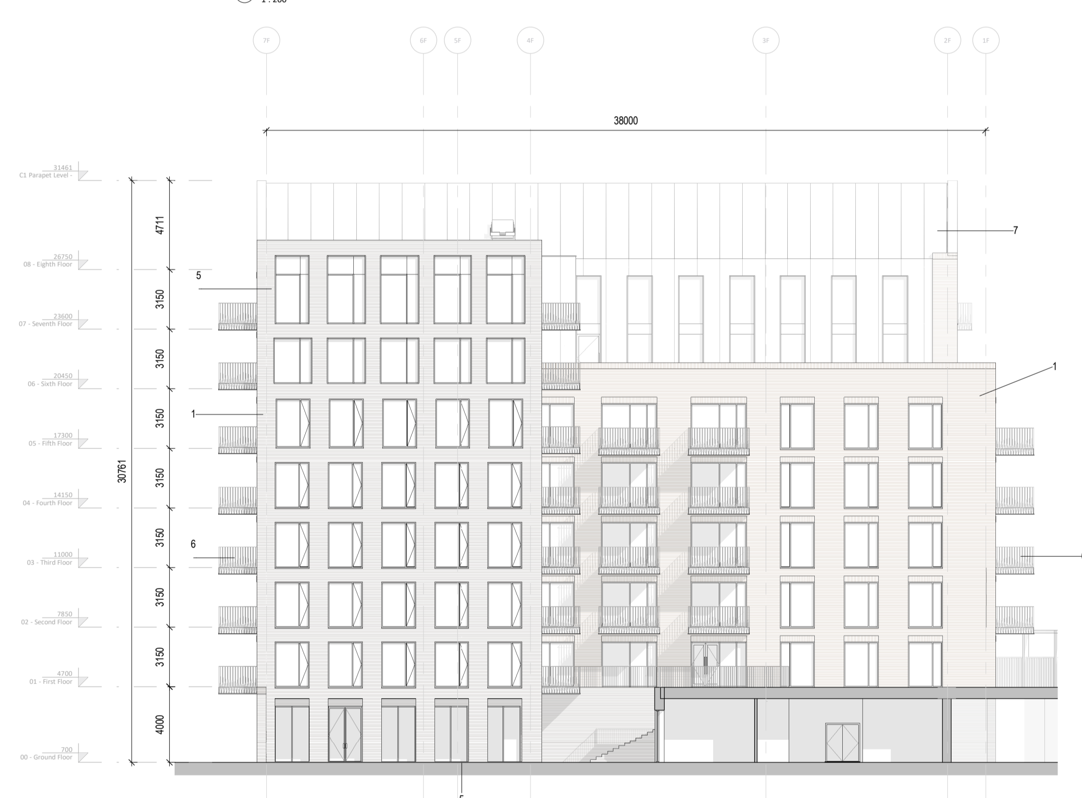
4 C1_North-West Elevation 1:200