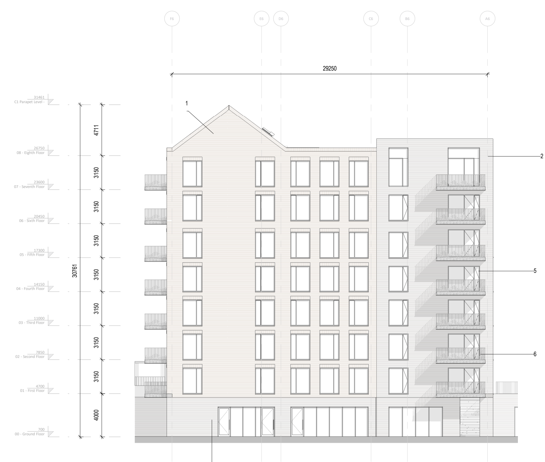
1 C1_North-East Elevation 1:200